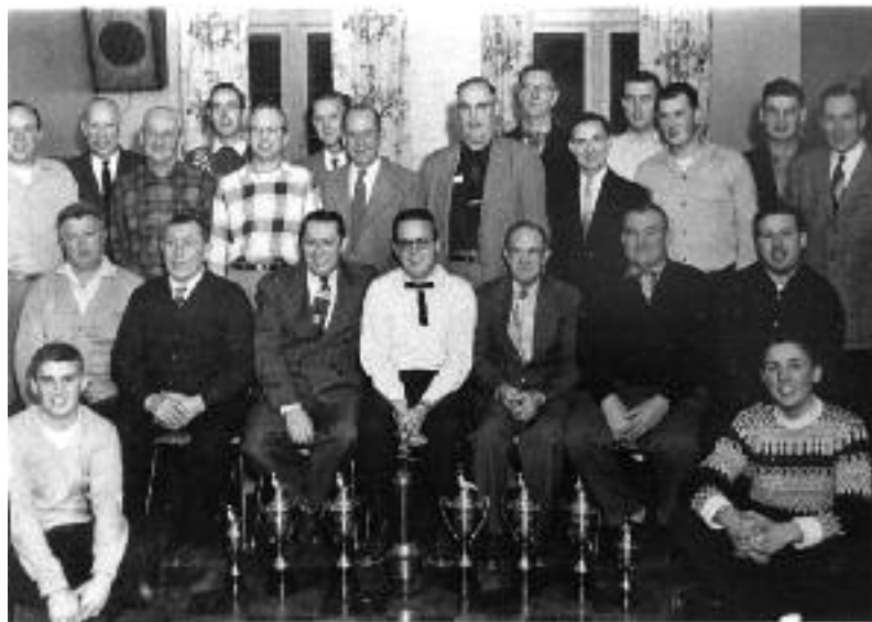
Members of the Pigeon Flying Club with trophies.