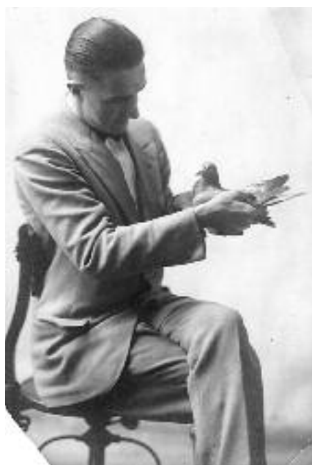
Two members of the Pigeon Flying Club