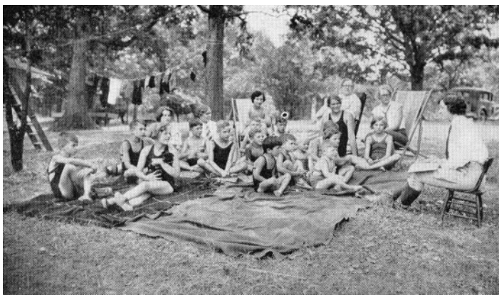
Evening story hour at Pike's Camp.

summer season was normally $240, but a $40 discount was offered if the camper enrolled by the first of May. This charge covered all of a camper's expenses including lodging, daily activities, instruction, food, and laundry. The Pikes did allow parents to send sums of money for incidentals like postage and stationary materials, but they limited the amount a parent could send to $10 in order to keep the children's expenditures under control. The Pikes also discouraged parents from sending boxes of edibles so that the campers' diet would be maintained or from visiting within the first two weeks of camp so as to avoid disrupting the schedule of activities. Despite these restrictions, the popularity of Miss Pike's Progressive Camp was evident because membership applications typically exceeded the camp's capacity.