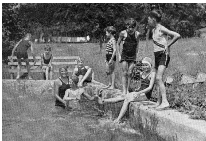
Every child at the camp was taught to swim and swim well.

The campgrounds included a large assembly and dining hall, a tennis court, a bridle path, a water slide, and a wading pool. There were sleeping cottages separated by age and gender that were equipped with electric lights and iron cots. The tuition for a single