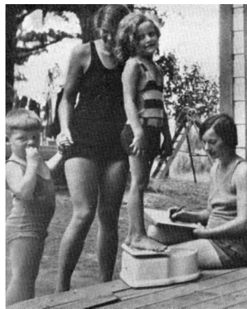
Daily camp weigh-in.

The combined boarding and day school initially offered instruction for boys and girls in the elementary grades, but it soon began to offer high school level courses as well. Instruction covered a range of disciplines including music, art, drama, home economics, French, swimming, shop, and horseback riding. Class sizes were kept small, with no more than 25 children assigned to every two teachers, and individual tutoring was available at no extra charge.