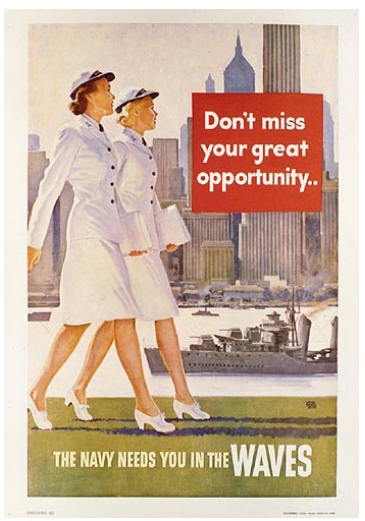
A WAVES recruiting poster from WWII.