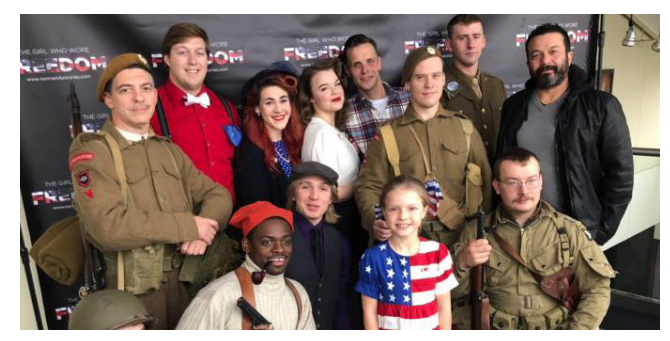
This year's Living History Day will feature WWII reenactors to recognize the 75th anniversary of the end of the war.

Fall continues unveiling our exciting, colorful, local history "Grave Reminders" narrative cemetery tours-(of which I have been a part for the past two years as a character re-enactor). I look forward to meeting you at one of our upcoming programs and events!